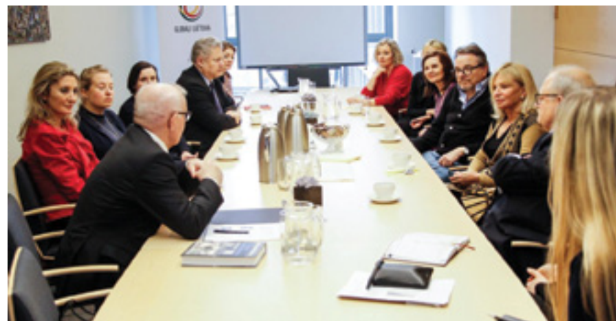
Reception at the Ministry of Foreign Affairs of Lithuania.