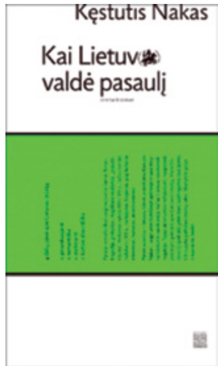
When Lithuania Ruled the World/Kai Lietuva valdė pasaulį by Kestutis Nakas.

A four-part play cycle dealing with Lithuanian history. Provocative, romantic, spiritual, and sometimes ludicrous. The play non-traditionally combines a variety of genres: farce, tragedy, grotesque, magic realism, and „pseudo-classicism.“ The action takes place in the 13th through 15th centuries with occasional leaps into the 20th century. Slang, pop culture elements, humor, and anachronisms abound.