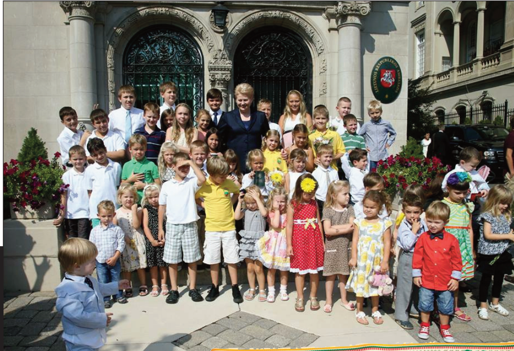
The President Dalia Grybauskaitė with students from Washington D.C. Lithuanian school.