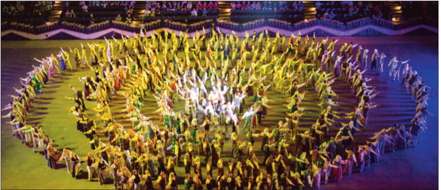
Lithuanian Dance Festival in Baltimore in 2016

The Lithuanian American Community, Inc. was established and incorporated in the State of Connecticut in 1951 for the purpose of uniting Lithuanians as well as their non-Lithuanian spouses and their offspring throughout the United States within a single, civic organized community. LAC has a well-established organizational structure and elected effective leadership capable of establishing and supporting Lithuanian language schools, organizing song, dance and theater festivals, athletic competitions, science and cultural symposiums. Through these and other activities, the LAC fosters the Lithuanian heritage and continues its legacy. Common Lithuanian roots help to unite LAC members for the preservation of the values and traditions of their ancestry. LAC members participate in the LAC governance, activities, and programs entirely on volunteer basis. The LAC is an active member of the Lithuanian World Community.