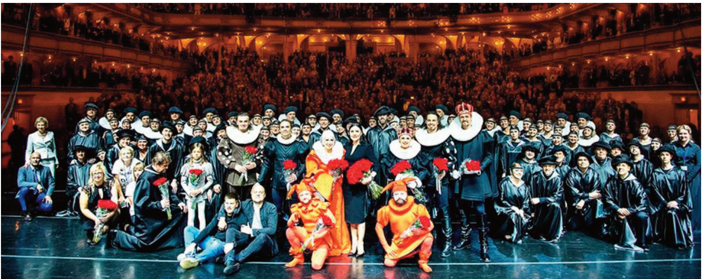
Opening night of the musical "The Legend of Barbora Radvilaite and Žygimantas Augustas" at Auditorium Theater, Chicago – LAC Cultural Council project in 2019.

It is important for every Lithuanian in the United States to actively participate in the Lithuanian American Community, because only such a large, unifying Lithuanian family, whose members nurture common values, can provide a conducive environment for preserving their cultural heritage, thus enriching themselves as well as their immediate community. We especially look forward for young people to join because their energy and creativity coupled with the knowledge and experience of the older generation will be the impetus for the Lithuanian American Community to prevail as a unifying force in implementing its mission. Let us work together to see that this organization flourishes.