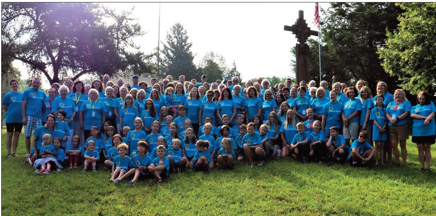
LAC Education Council professional development seminar participants at Camp Dainava in Manchester, MI, summer of 2019.