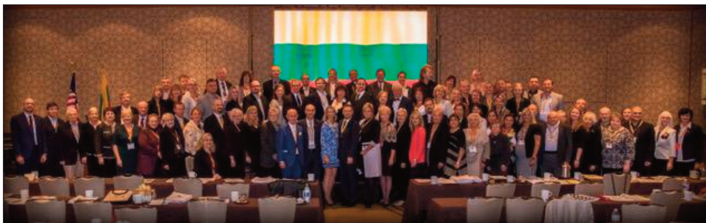
LAC XXII National Board of Directors second session participants in Chicago, IL.

The National Board of Directors is the highest governing body of the LAC. Currently the Board of Directors has 70 members: 60 elected from respective districts and 10 district presidents serving ex-officio . (See p. 9 as well as LAC Bylaws at www.javlb.org for more information.)